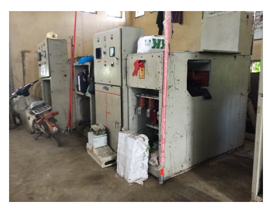
Shwe Pauk Kan Substation