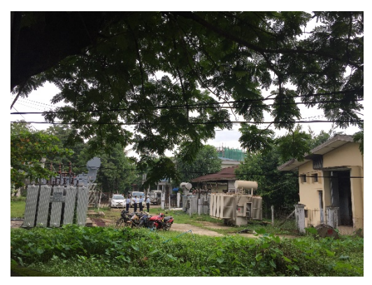
North Okkalapa Substation